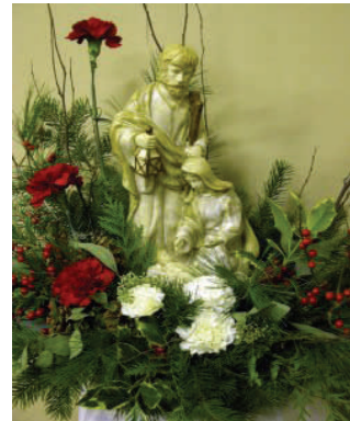
The Holy Family in Our Sanctuary

January 23 7 PM "The Secret" movie and discussion