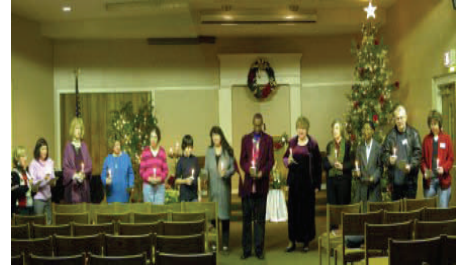
Christmas Eve Candlelight Service