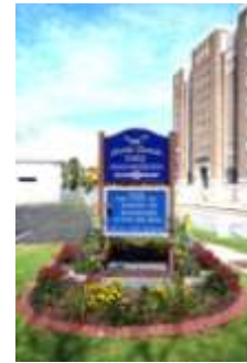
CCU Sign with landscaping