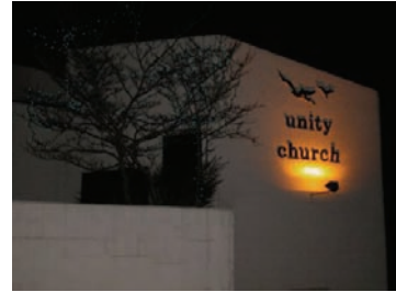
CCU at night