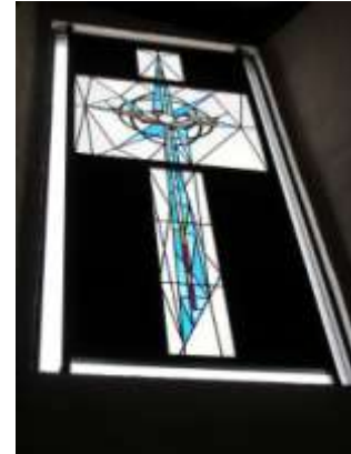
CCU Stained Glass Cross