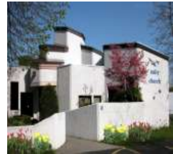
CCU in the spring