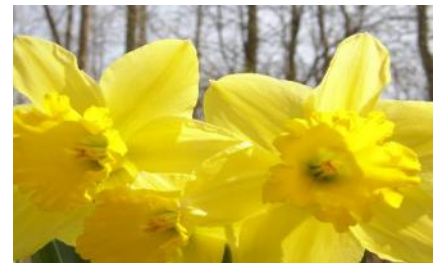
Spring Flowers