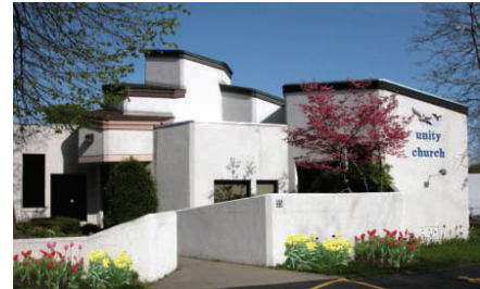
CCU in the spring