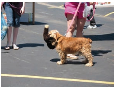
There was something for everyone at this years Circulation Day ☺

Thank you for making our Sunday Service fragrance-free.