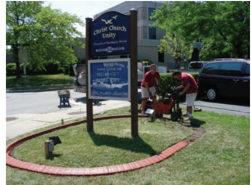
Installation of the new curbing around the sign

Course in Miracles Workshop with Jon Mundy