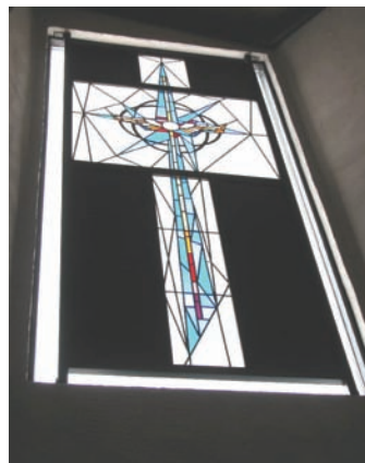
Our stained glass cross