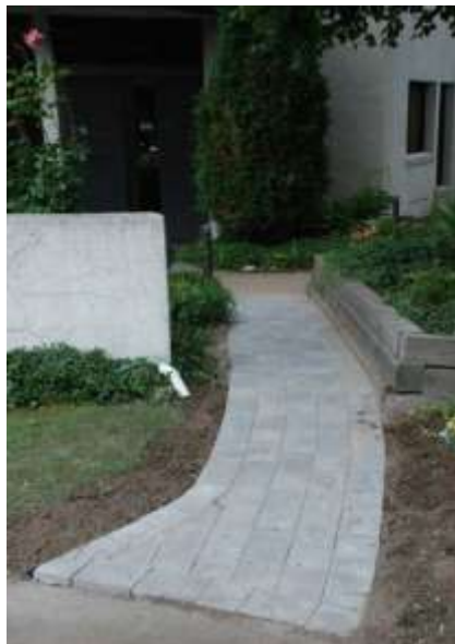
New Walkway at CCU